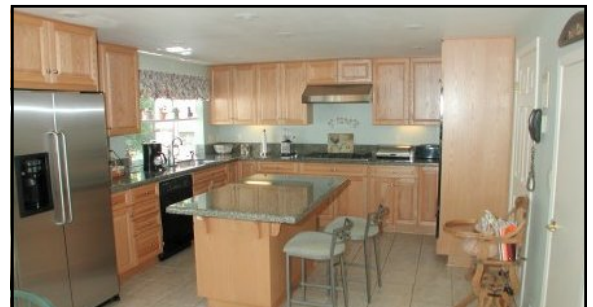
Gourmet kitchen with granite counters